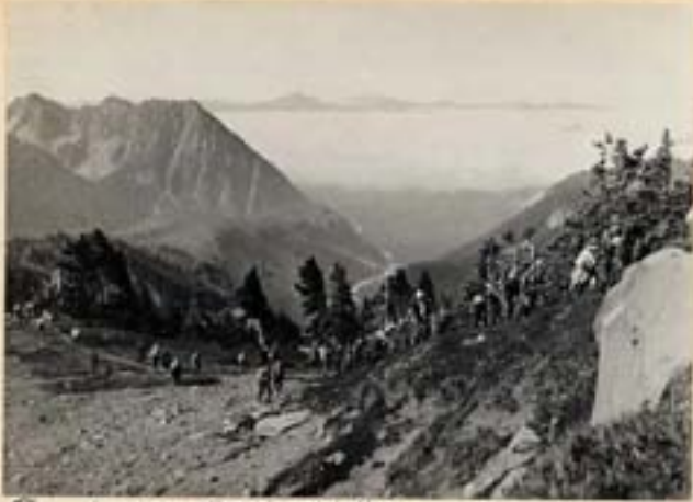
9. Leaving Paradise Valley