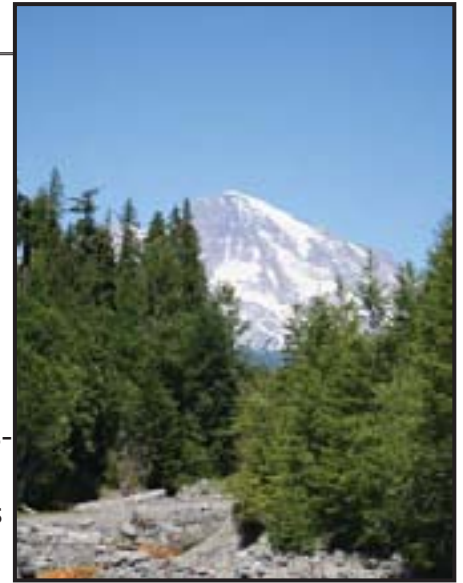
What happened on Mount Rainier’s Nisqually glacier in 1924? See if you can find the answer!

“I don’t envy them [the guides] their job when the mountain is acting up.” — Cecil B. DeMille, film director