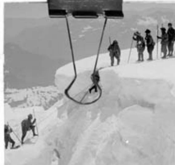
Climbers on Mount Rainier, c. 1920s.

Others came from far away to test themselves against the mountain. One of those was famous movie director, Cecil B. DeMille.