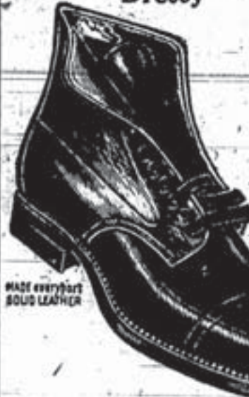
MADE EVERY PART SOLID LEATHER