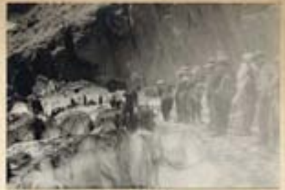
11 Nigwally Glacier