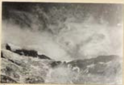
10 Whirling Clouds