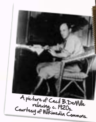
A picture of Cecil B. DeMille relaxing, c. 1920s.

Mountaineering is an important part of Washington's history. Mountains abound. The important thing if you decide to climb one is to stay safe and be prepared!